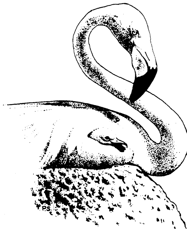
Galapagos Flamingo: Drawing by Peter Scott