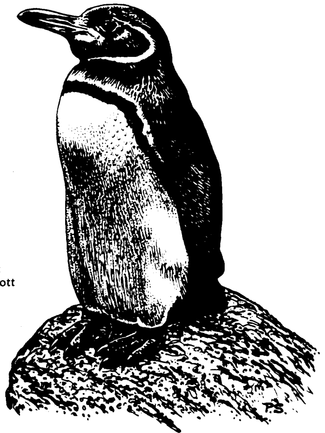
Galapagos Penguin: Drawing by Peter Scott