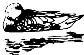
PATILLO - Anas bahamensis

My research is now almost finished. I've lived on Alcedo for nearly a year. It has been a year full of absolutely unforgettable experiences. Shortly I'll be returning to the University of Florida to analyze my data and complete my doctoral programme. I am glad to think that my findings will add to our understanding of the Galapagos Islands system and help provide the National Park Service with guide lines concerning control or eradication of the feral burros.