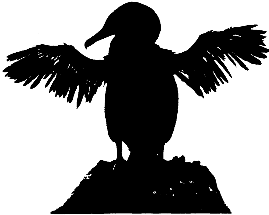
Flightless Cormorant